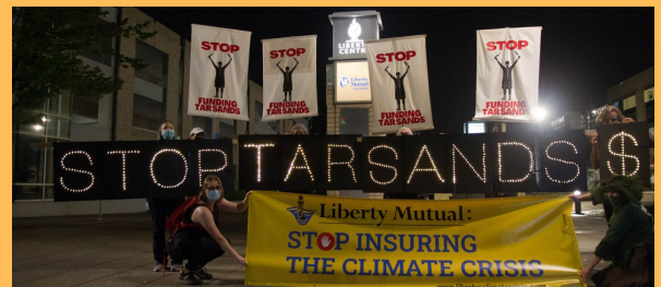
National Day of Action against tar sands funding

Also in 2020, the Power Past Fracked Gas Coalition (which 350PDX belongs to) kept up legal pressure against the Perennial Windchaser Fracked Gas power plant being proposed for Umatilla County. As this report goes to press, news has just broken that the project is being abandoned.