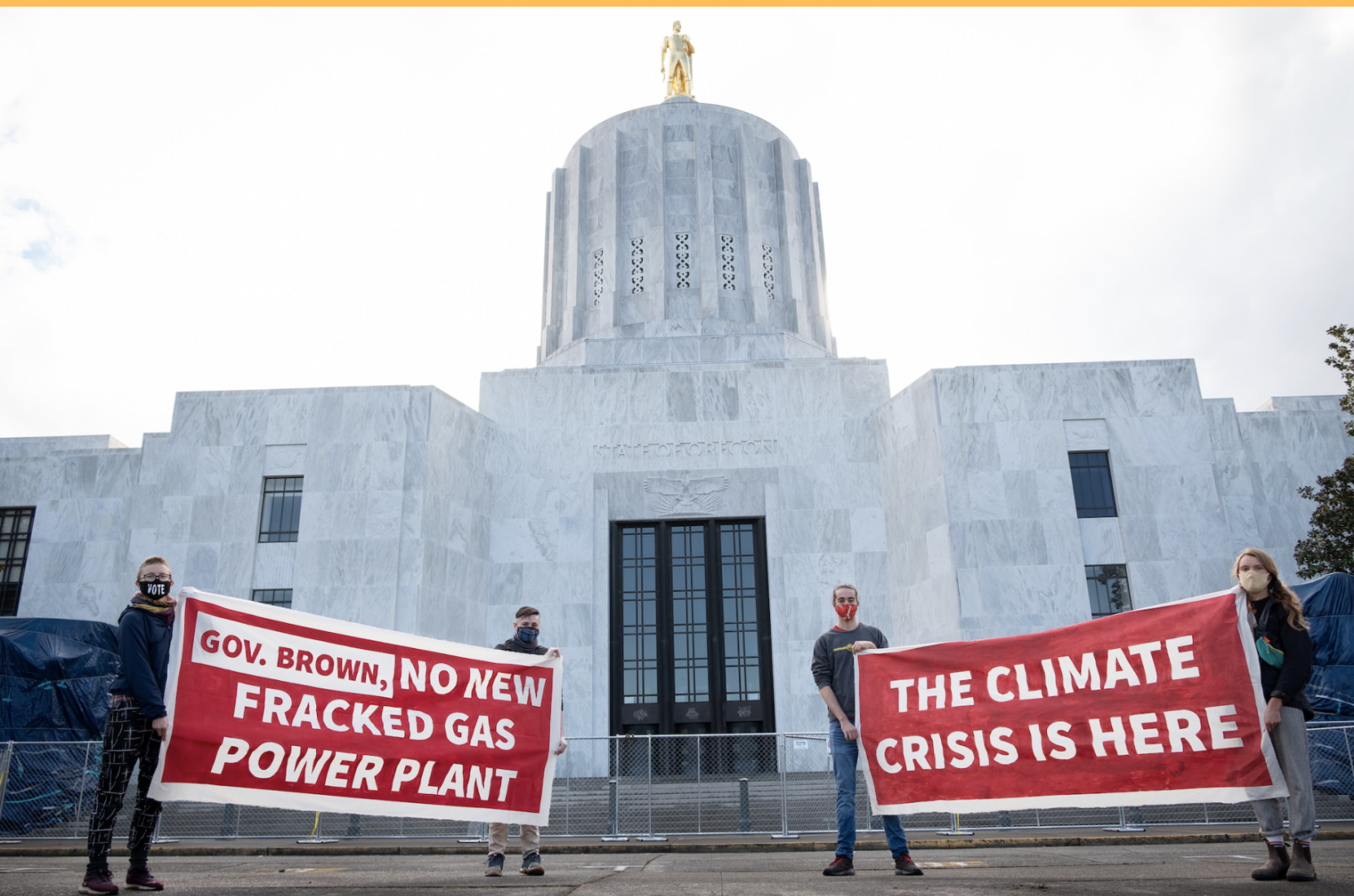
Activists in Salem