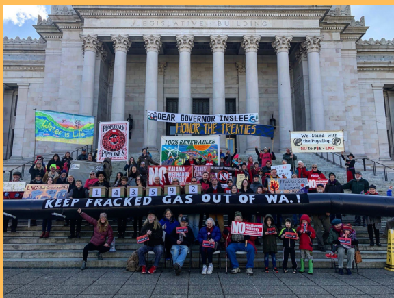
No Fracked Gas rally, Olympia

You probably have heard the good news by now: in January 2021, the Federal Energy Regulatory Commission (FERC) upheld Oregon's denial of key permits for the Jordan Cove project, leaving it likely without avenues for further development. We also kept our eyes on the proposed Kalama (WA) methanol refinery. September was our month of action against the project and we racked up 11 hours of virtual hearings to the Washington State Department of Ecology, with the majority of testifiers coming out against the project. Days after the good news on Jordan Cove, authorities in Washington State denied crucial permits for the Kalama refinery.