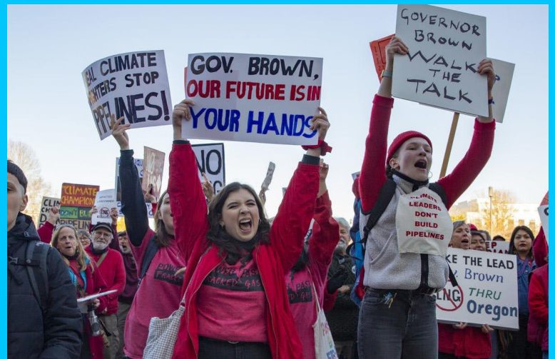
No LNG rally